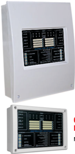
Compatible Repeater Panel

Model No: CFS-FAP4002, CFS-FAP4004, CFS-FAP4008